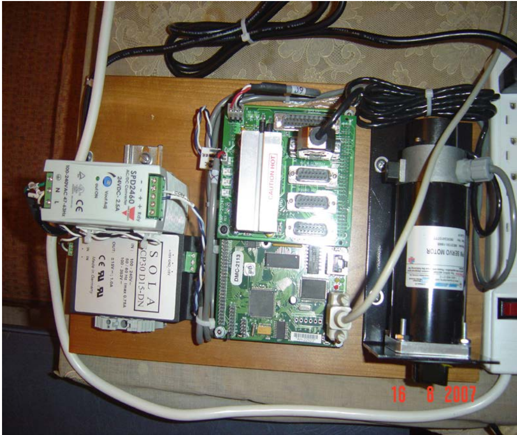
Amplifier/Power Supply · Controller · Motor/Encoder